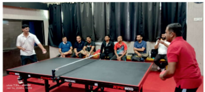
TABLE TENNIS MEN'S SINGLE CATEGORY: