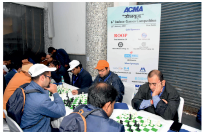
The competition received an enthusiastic response, with players

The ACMA, Northern Region HR Forum organized the खेलकूद – 6th Indoor Games Competition on January 25th, 2024, at Thyagaraj Stadium, New Delhi. The event aimed to foster camaraderie among ACMA members.